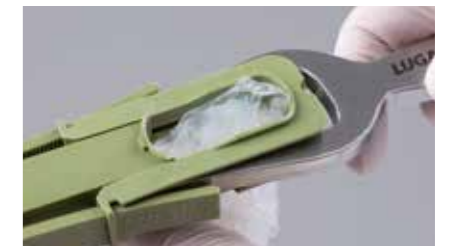
Separate the crimps