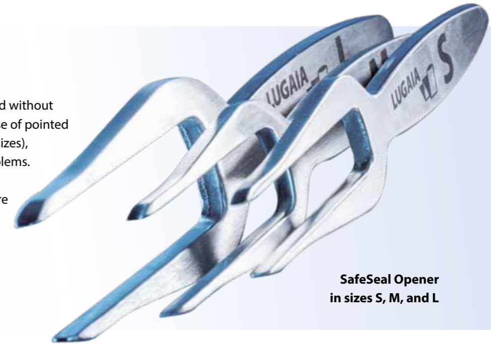
SafeSeal Opener in sizes S, M, and L