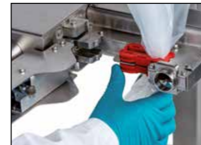
Insert SafeSeal Crimp