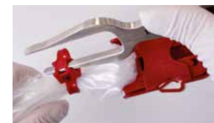
Loosen the cable tie cover