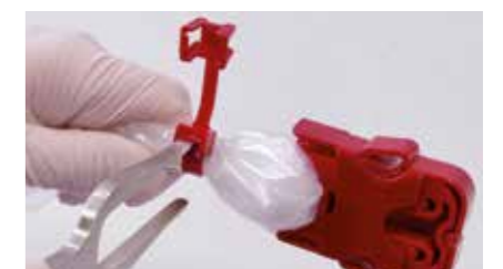
Loosen the cable ties