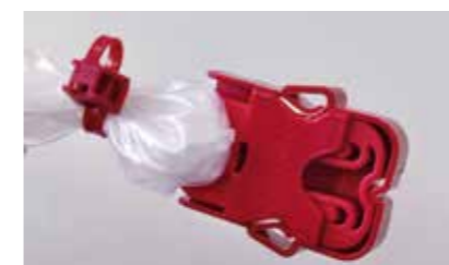
Installed protective cap