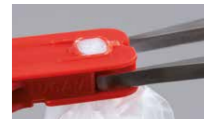
Insert the opener, the outer crimp opens