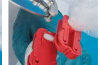
Both parts locked