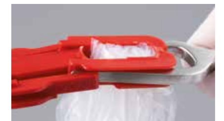
Separate the crimps