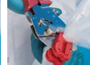
Cut through / separate