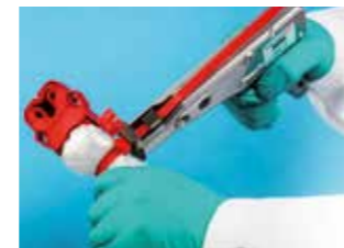
Tighten cable ties