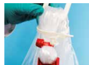
Put on cable ties