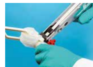
Tighten cable ties