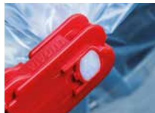
Lugaia SafeSeal Closure