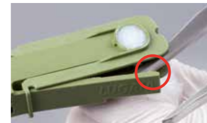
Break open the safety brackets on both sides