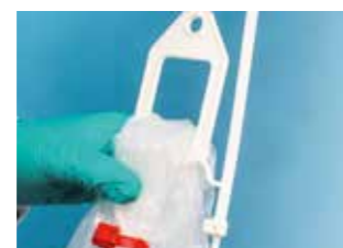
Bend the foil