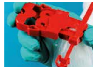
Put on the protective cap