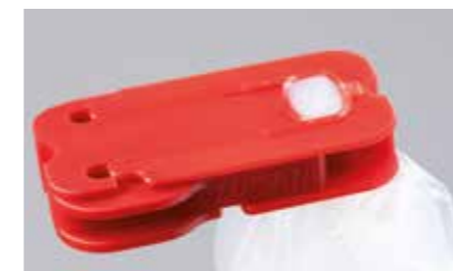
Lugaia SafeSeal Closure