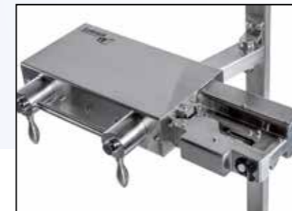
SafeSeal Pneumatic Tool