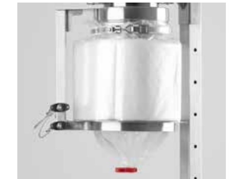
Continuous Liner System (CLS)