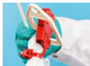
Slip the hanging tool on