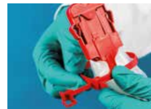
Put on cable ties