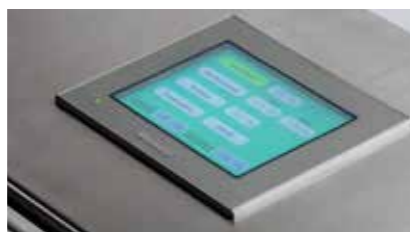
PLC-Software with HMI touch panel

The mobile ventilation unit is equipped with PLC-Software and is operated via a HMI touch panel. The complete circuit and control technology is built into the equipment cabinet. The ventilation unit is available in standard or ATEX versions. In both versions, the equipment cabinet is made entirely of stainless steel.